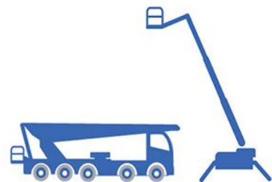
1b Static Boom